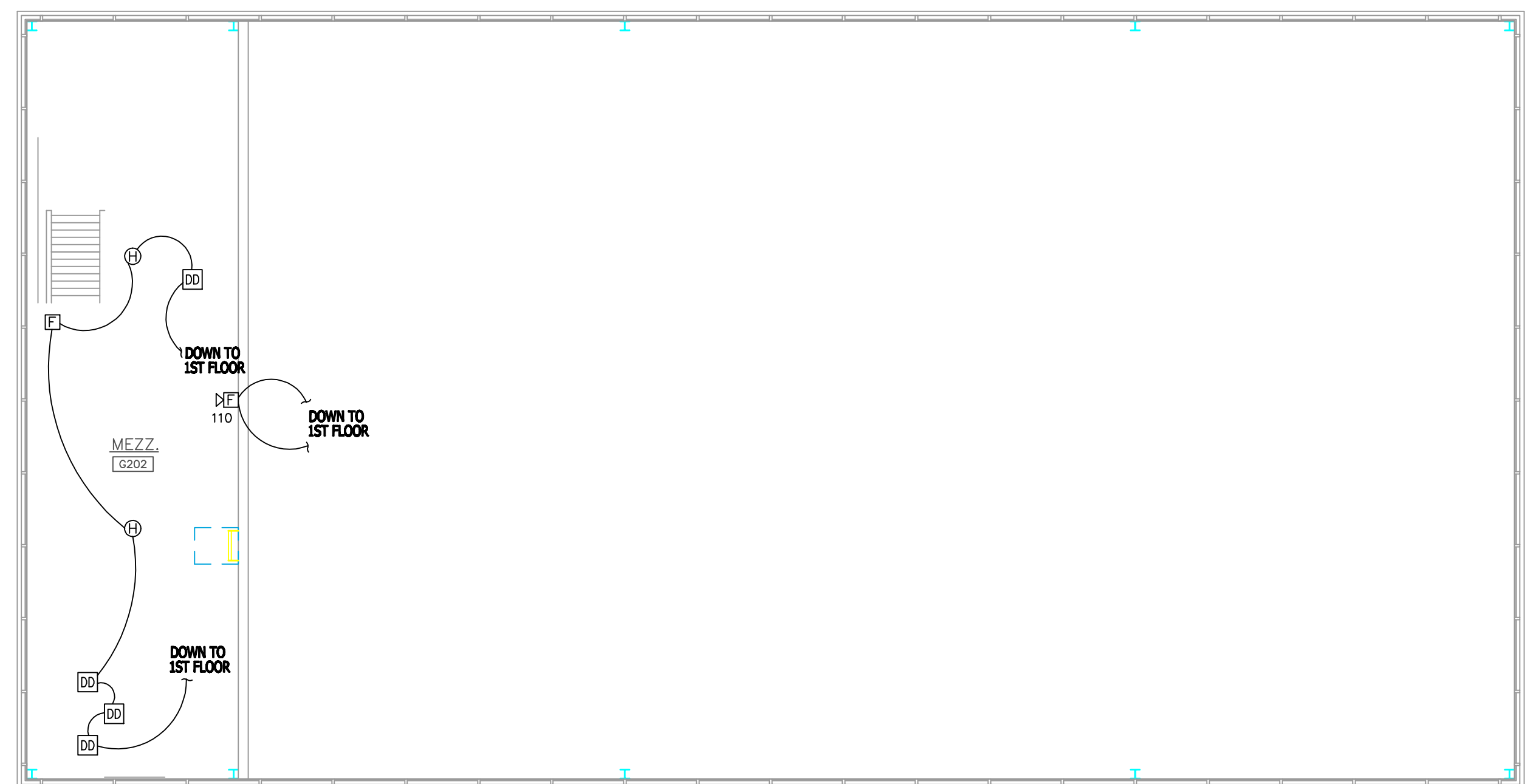
2 FA4 Fire Alarm Plan - Mezzanine SCALE: 1/8"=1'-0"