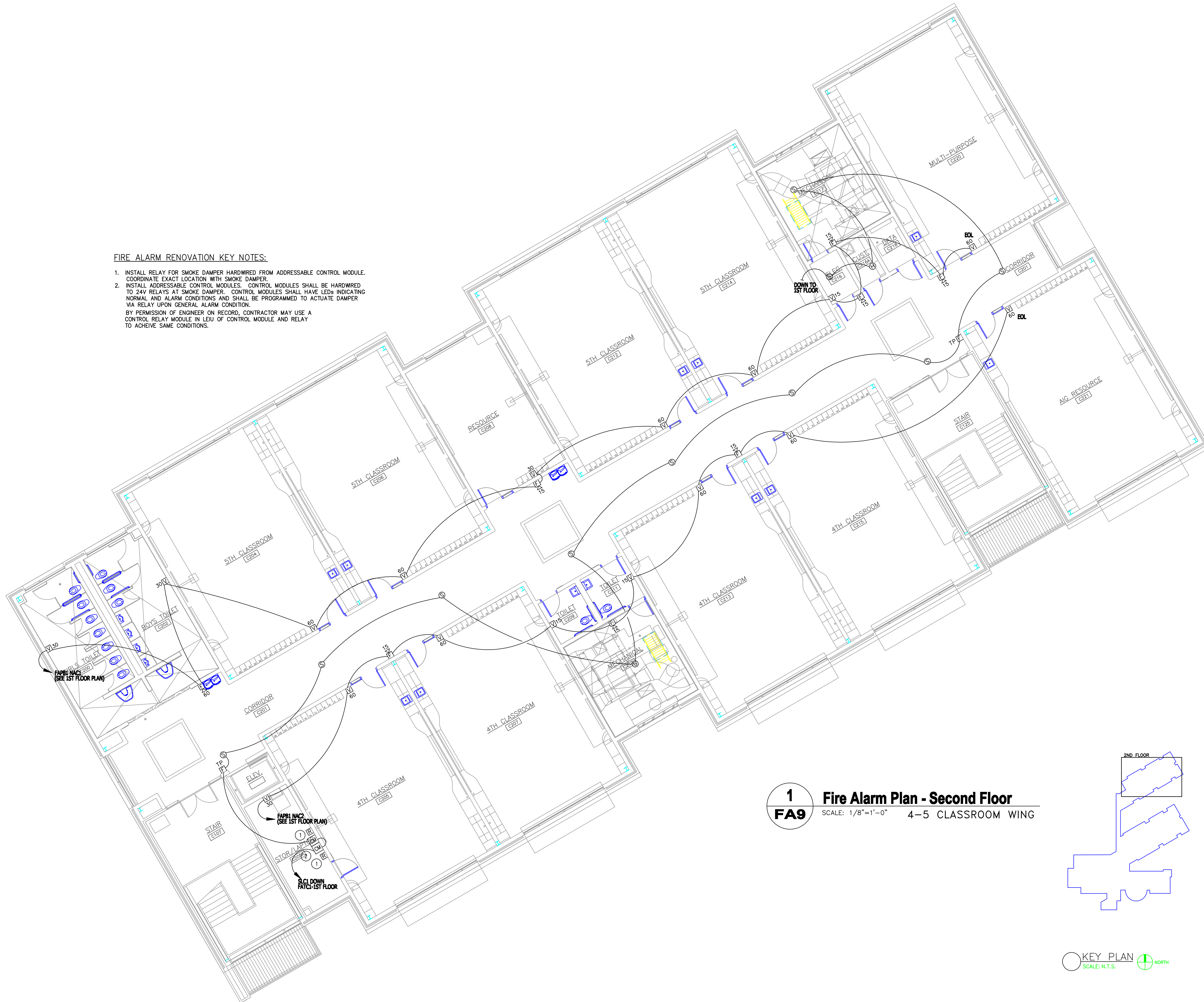
1 FA9 Fire Alarm Plan - Second Floor SCALE: 1/8"=1'-0" 4-5 CLASSROOM WING